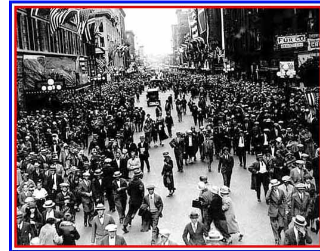
Urban Norwegians – 1925 Centennial Celebration Nicollet Avenue, Minneapolis

Thursday, 1 August 2002 Friday, 2 August 2001 Saturday, 3 August 2001