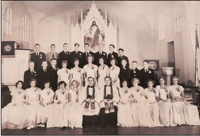
A confirmation photo from 1951.