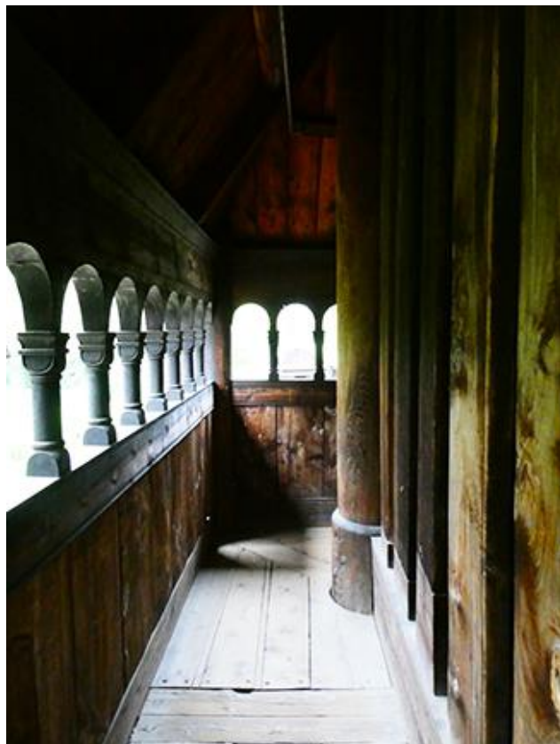
The ambulatory at the Gol Stave Church.

NHOH has written permission from the publisher to use articles giving credit and providing information on how to subscribe. This article originally appeared in the November 1, 2019, issue of The Norwegian American . To subscribe, visit www.Norwegianamerican.com click on SUBSCRIBE or call (206) 784-4617.