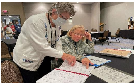
2021 Stevne Photos

Serve with boiled potatoes. Like all good stews, fårikål's flavor improves with a day of rest in the fridge, so consider making it a day before you want to serve it.