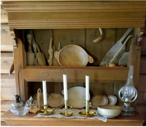
This hutch was made many years ago; in the top half are the handmade wooden utensils and bowls used over generations.