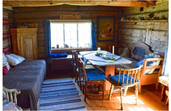
The main room has a very old cupboard, left, made by a family member long ago, and other classic old furniture.